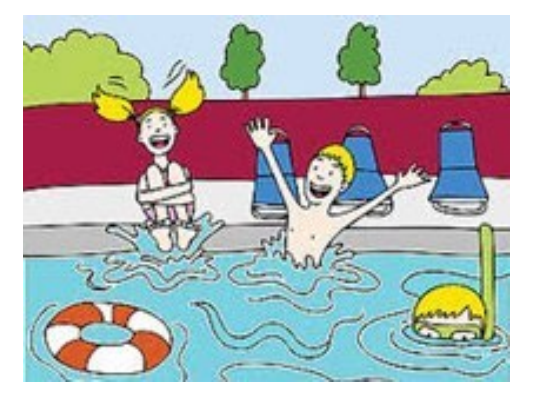
We don't have pool deck elves! We do have a Bullfrog!! Let's have a safe and happy summer!!

Don't leave pool toys in pool - they clog up the skimmers and cause trouble. Be sure to keep the pool gates locked, bathroom doors closed, and that your guests have a key if you're not present. Anyone without a key may be asked to leave. Children under 16 are NOT allowed at the pool without an adult guardian!